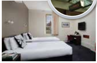
The Victoria Hotel ★★ ★