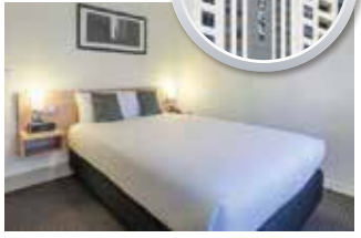
Ibis Melbourne Hotel and Apartments ★★ ★